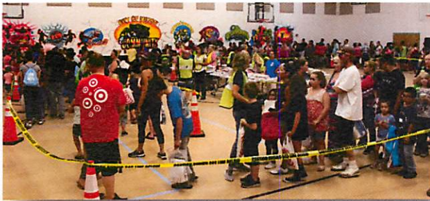
Participants line up to receive gift bags of school supplies.