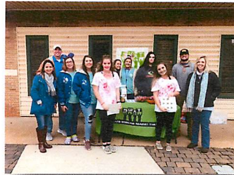
SWAT youth and advisors at the October 2019 Trick or Treat in the Streets event in Jay, FL

In October 2019, SWAT youth from Jay High School successfully petitioned the Jay Town Council to make the Halloween "Trick or Treat in the Streets" a tobacco free event.