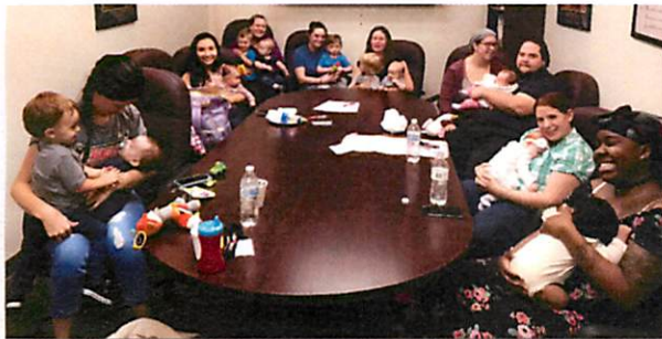
The Milton WIC Milky Way breastfeeding support group.

In January 2018, WIC introduced its breastfeeding support group The Milky Way . The group meets once a month at the Milton Public Library on Alabama Street and is open to all pregnant and/or breastfeeding mothers, nursing infants, and toddlers, whether or not they participate in WIC. The group has been so successful that it was expanded to the Midway location in January 2020.