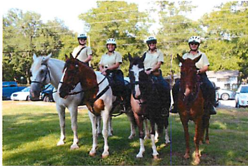
2019 Santa Rosa Sheriff's Posse at the National Night Out.