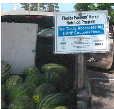
The Farmers Market Nutrition Program offers a variety of seasonal fresh, locally grown produce.

The WIC Farmers Market Nutrition Program (FMNP) , a collaboration between the Florida Department of Agriculture and WIC, provides WIC clients with coupons that allow them to purchase fresh fruits and vegetables from participating vendors at no cost. DOH-Santa Rosa hosts a farmers market on-site at its Milton location throughout the summer. The market is open to the public and WIC coupons are accepted. In 2018, $24,600 in coupons were distributed to WIC clients for use at farmers markets throughout the area.